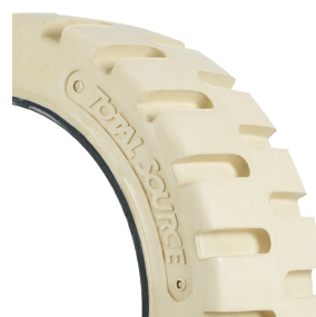
Traction Non-marking Tracción que no marca Traction non marquant