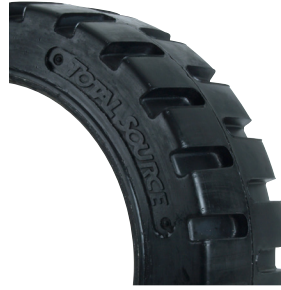
Traction Tracción Traction