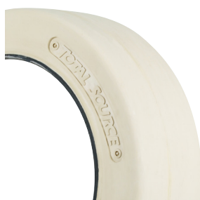
Smooth Non-marking Lisa que no marca Lisses non marquant